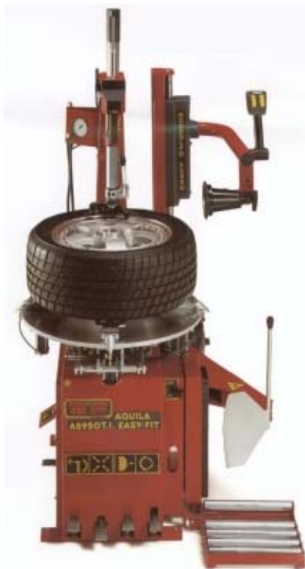
MF 960 All Wheel Tire Changer