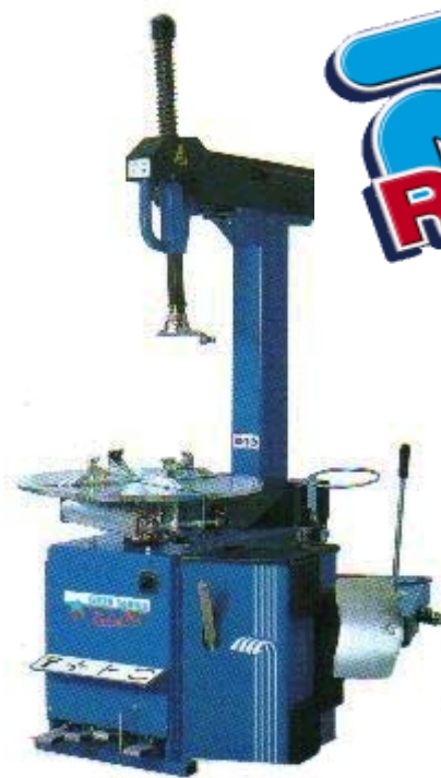
Rav Tire Changer