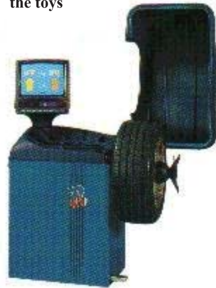
Rav Wheel Balancer

Rav equipment is reliable, easy to use and well priced. It does the job without all the toys