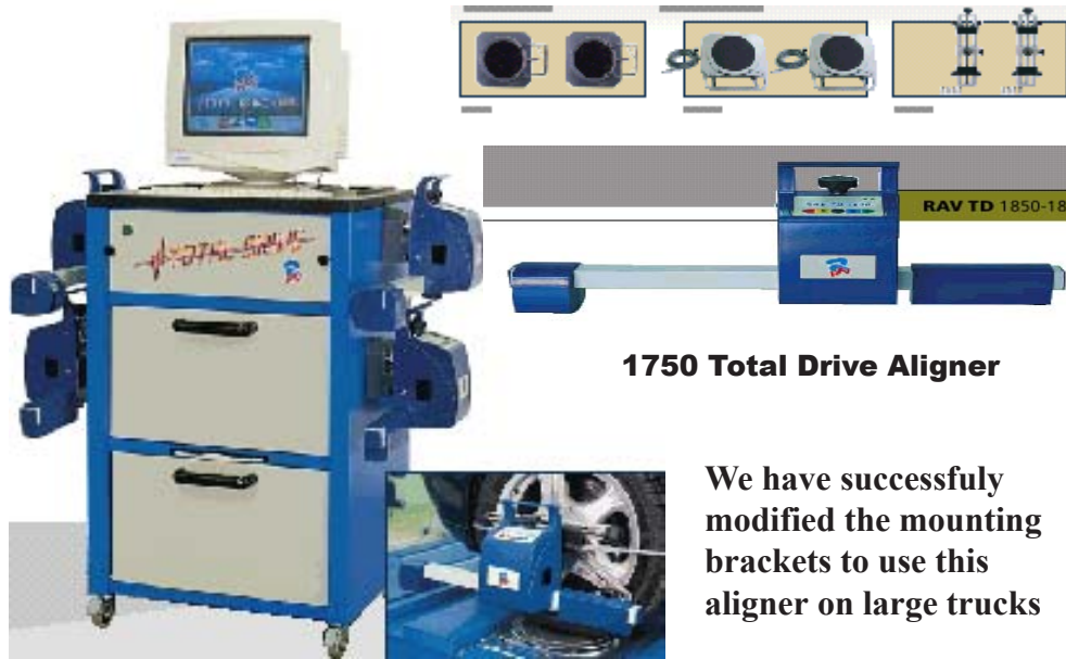
1750 Total Drive Aligner

Rav manufacture an 8 sensor alignment machine that is point to point laser. The only cables required go from the heads to the computer. It is also the only unit we know that is programable for under $20,000